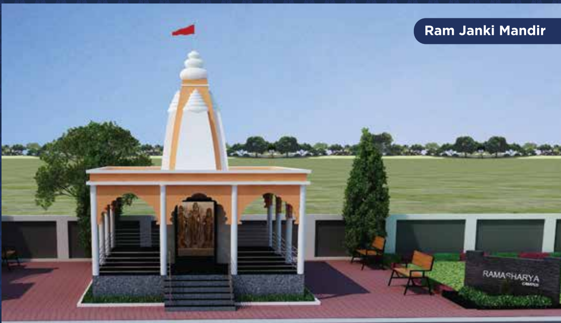
Ram Janki Mandir